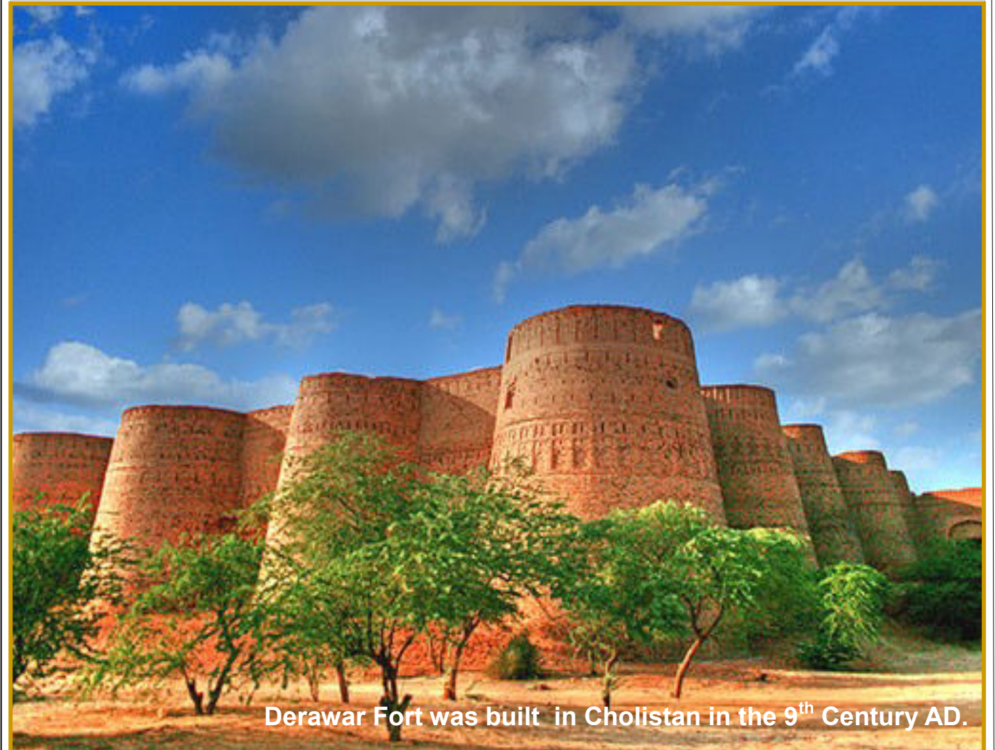
Derawar Fort was built in Cholistan in the 9 th Century AD.