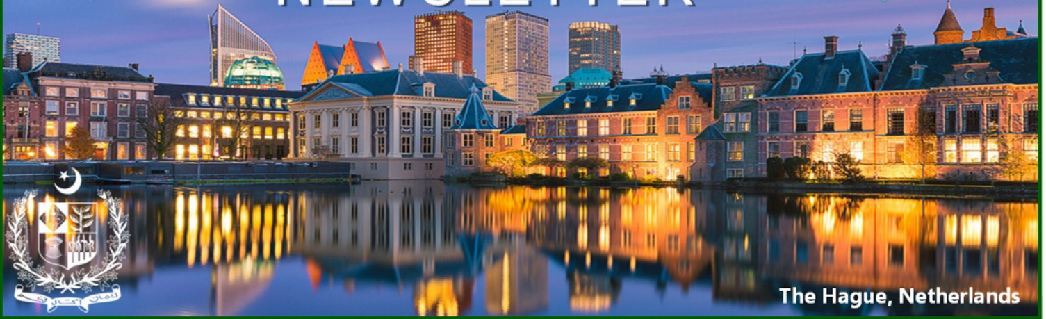
The Hague, Netherlands