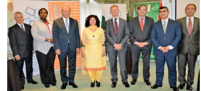
September 28, 2016