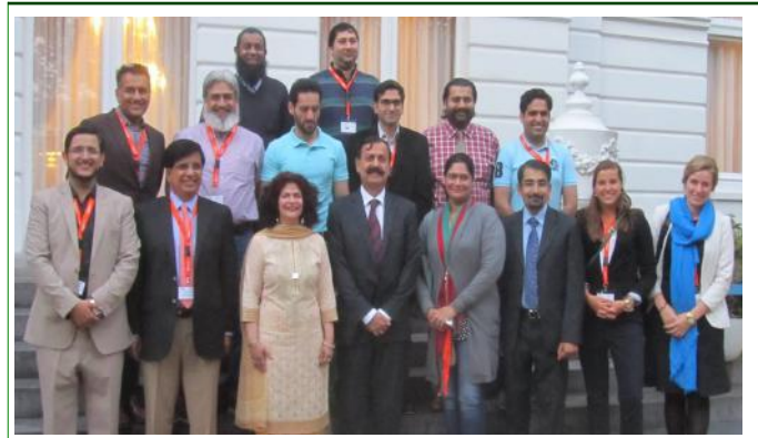
September 21, 2016