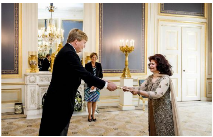
September 1, 2016